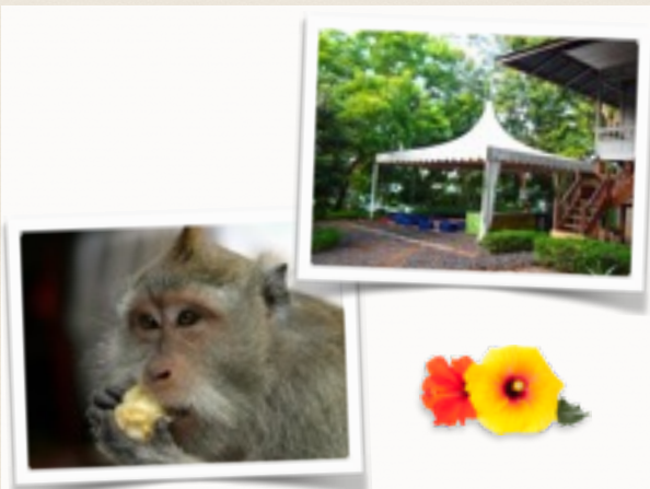
SERC Research Station, Bali Barat National Park