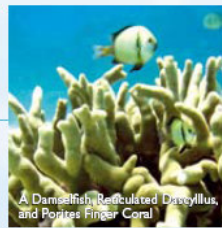
A Damselfish, Redulated Dactylius, and Porites Finger Coral