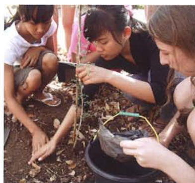
Planting a tree at the Scientific Education and Research Center