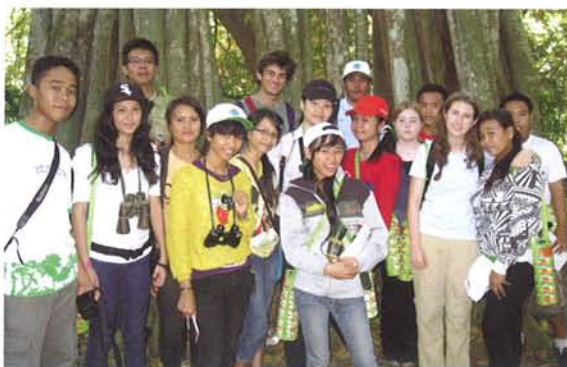
Group shot while exploring the local monsoon forest

To find out more about Biosphere Foundation's Conservation & Education Programmes, visit biosfirindonesia.org