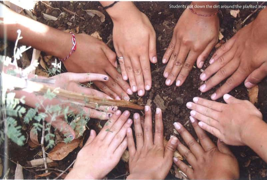
Students pat down the dirt around the planted tree