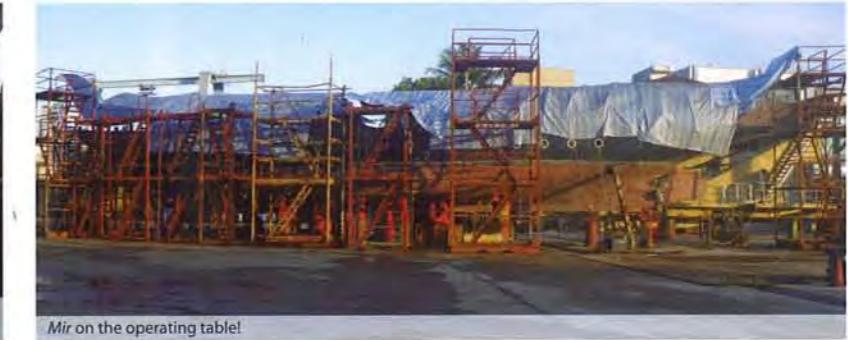
Mir on the operating table!