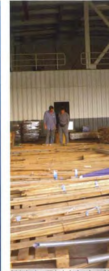
Original teak restored to lay back on the steel deck