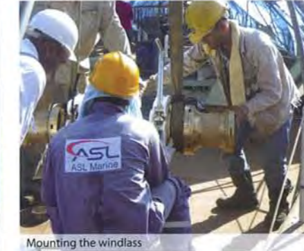
Mounting the windlass