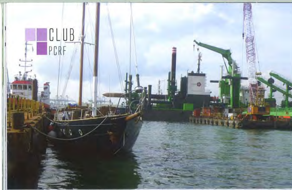
Mir arrives at ASL shipyard, 24 October 2011