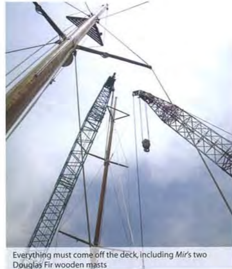
Everything must come off the deck, including Mir's two Douglas Fir wooden masts