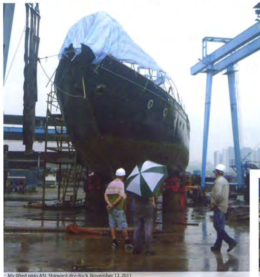
Mir lifted onto ASL Shipyard dry-dock, November 12, 2011