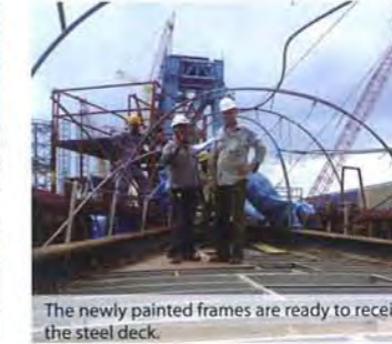
The newly painted frames are ready to receive the steel deck