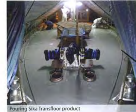
Pouring Sika Transfloor product