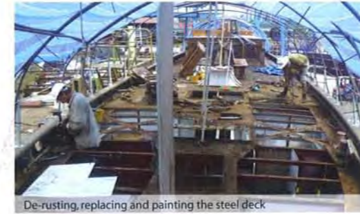
De-rusting, replacing and painting the steel deck