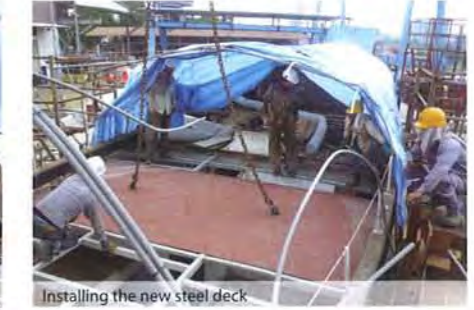
Installing the new steel deck